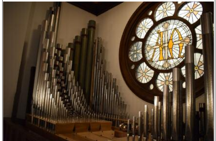
Our September puzzle was a photo supplied by Emery Bros. of the organ at St. Mary's, Hamilton Village, 'The Episcopal Church at Penn.'